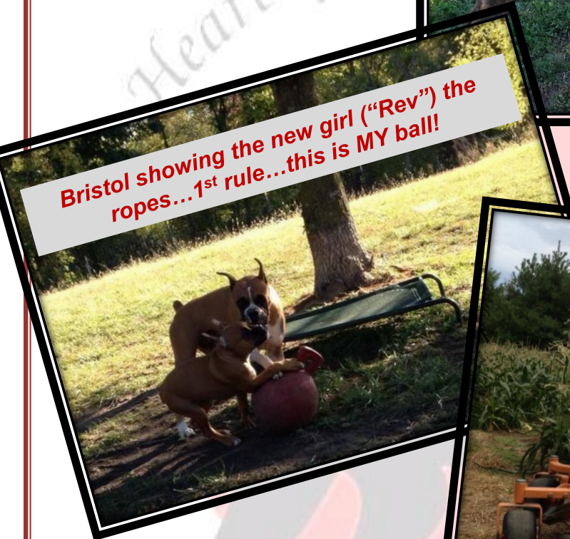
Bristol showing the new girl ("Rev") the ropes...1 st rule...this is MY ball!