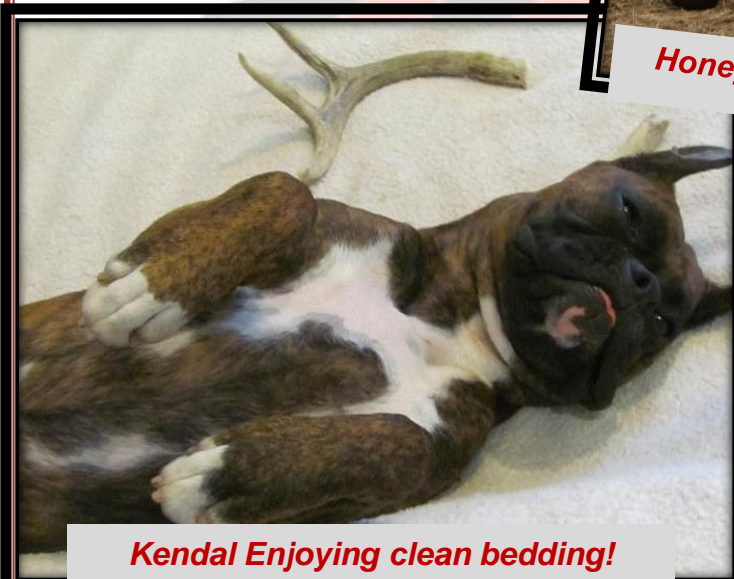
Kendal Enjoying clean bedding!