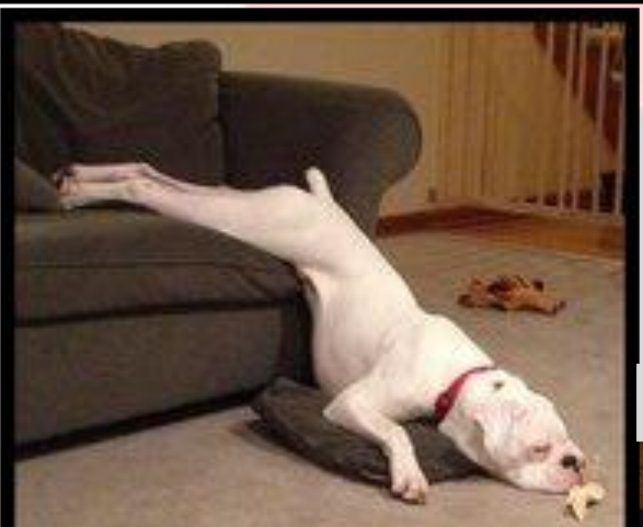
Ever had a day like this...