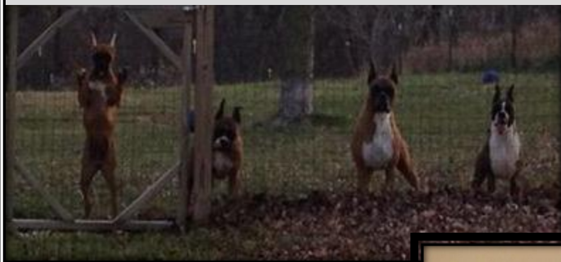
The FarMore Gang...come on in!