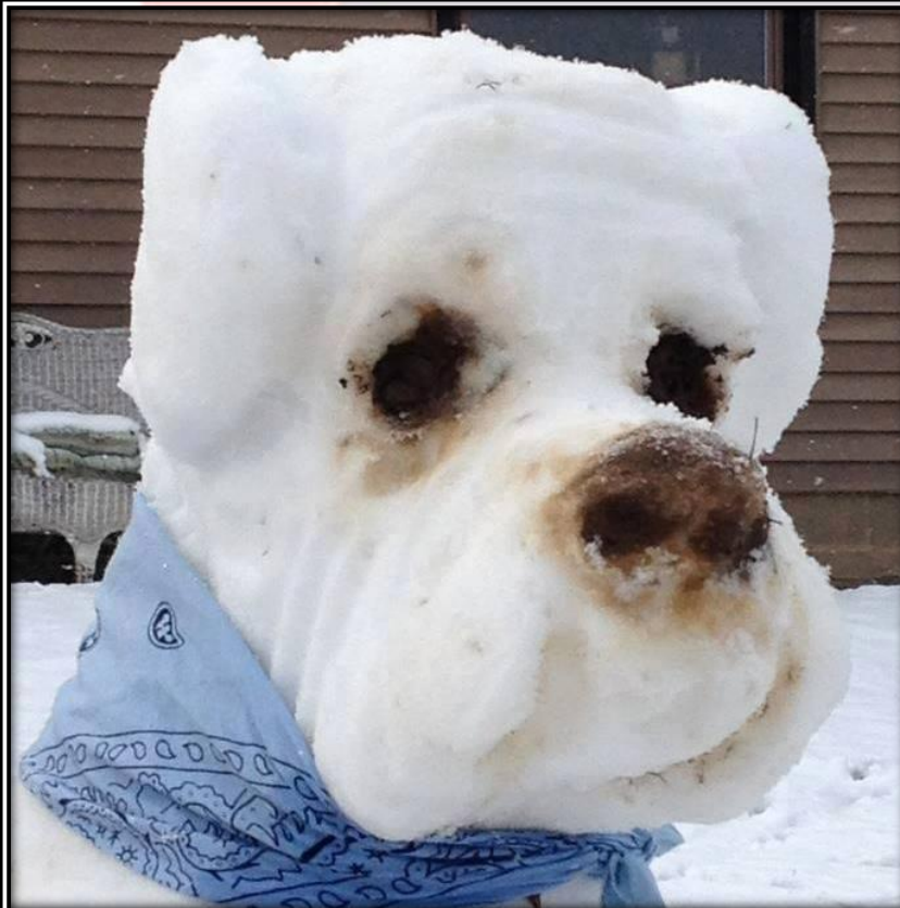
I think EVERYONE should try their hand at Boxer Snow Sculpting with the next snow!!! Who is IN!?