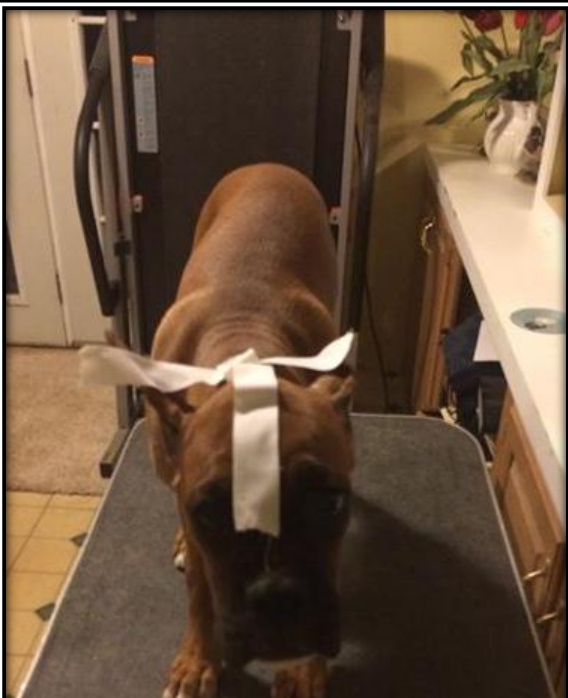
Dan's first attempt at taping up Rev☺ "Nailed it!"