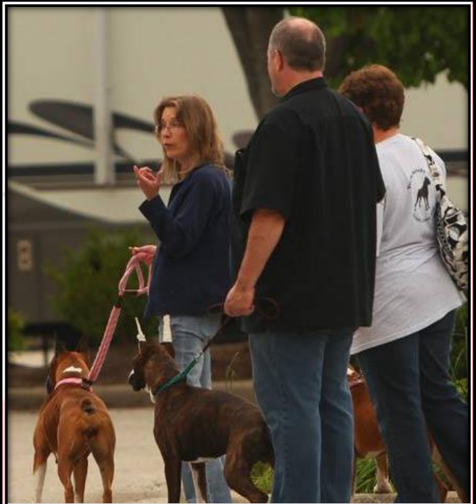
Wonder what Sabrina is expounding upon the virtues of.....??