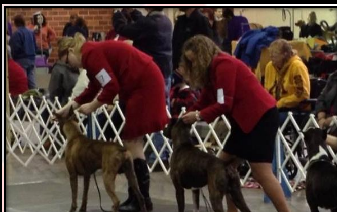
Sully and Dover in for Winners Dog – January Des Moines