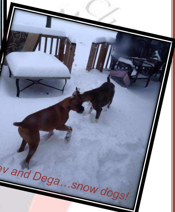
Rev and Dega...snow dogs!