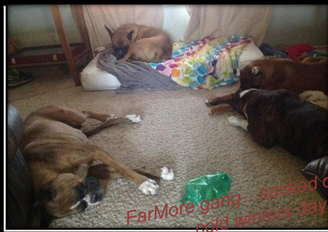
FarMore gang...sacked out on a cold winters day