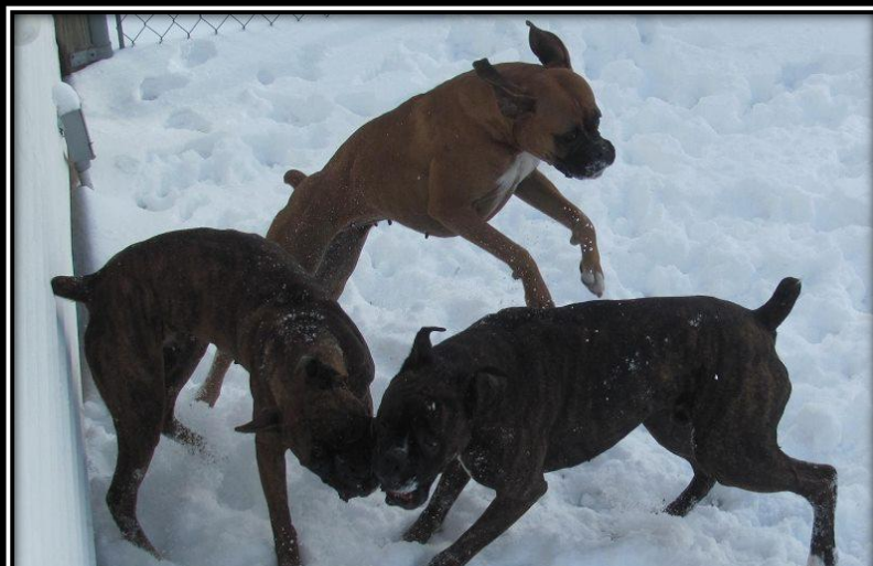
The McFarland clan...breaking in the snow!