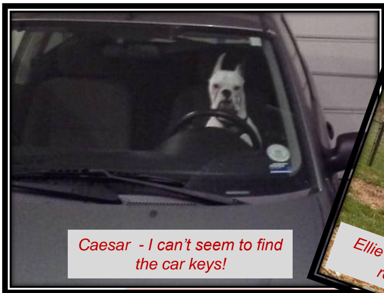
Caesar - I can't seem to find the car keys!