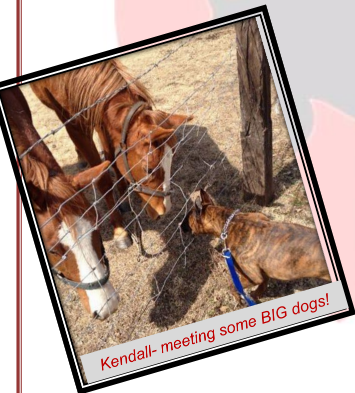
Kendall- meeting some BIG dogs!