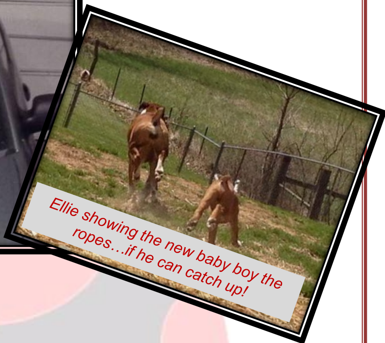
Ellie showing the new baby boy the ropes...if he can catch up!