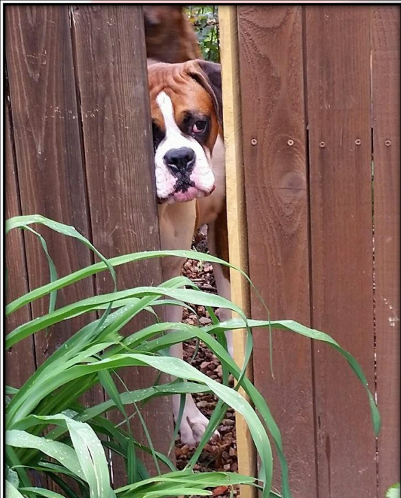
Peeking through the fence....