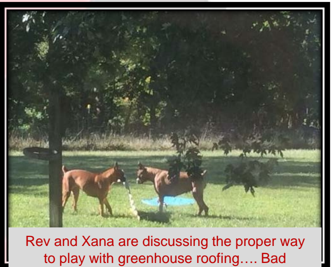
Rev and Xana are discussing the proper way to play with greenhouse roofing.... Bad dogs....