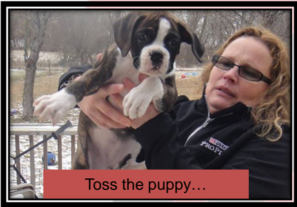
Toss the puppy...