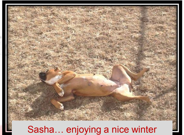
Sasha... enjoying a nice winter day...