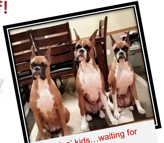
The Higgins' kids...waiting for breakfast...