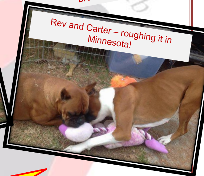
Rev and Carter – roughing it in Minnesota!