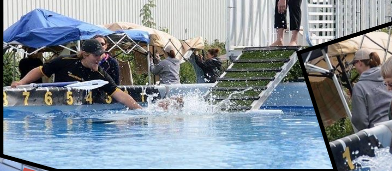
Ascan – Papageno's Red October v Eurozone Dock Diving- attempts ☺ Lincoln, Nebraska shows