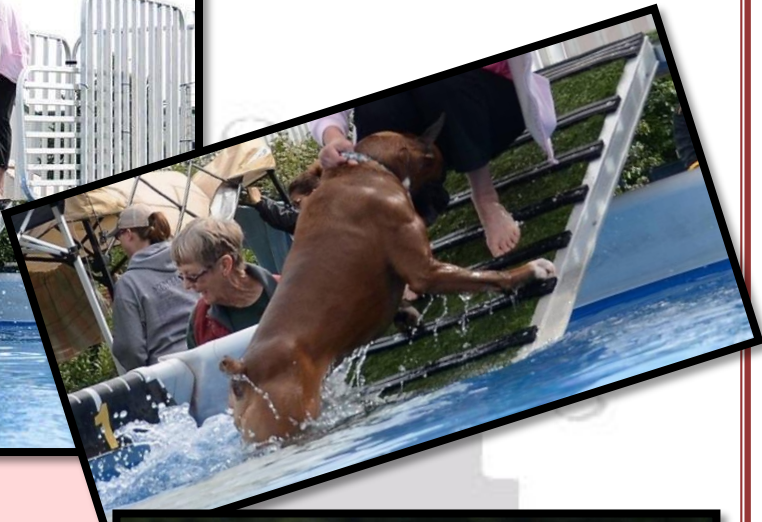
Sugar Hills North to Alaska "Sophie"