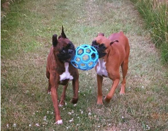
Miles and Sophie- having a bit of a ball....