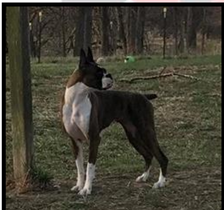
Talladega- keeping the Gates property safe since 2011