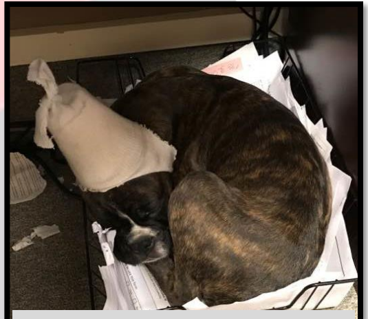
Sabrin's new boy... napping in the most inconvenient of locations 😊