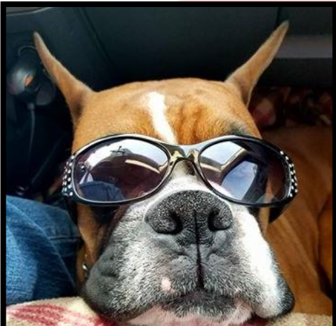
Darryl– rocking the shades