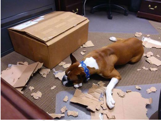
Daryll – hard at work... working like a dog.