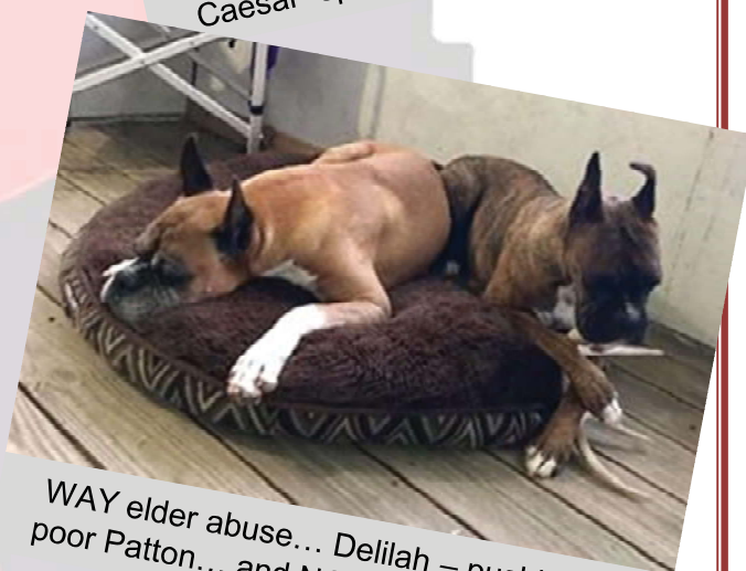
WAY elder abuse... Delilah – pushing on poor Patton... and NOT sharing her antler