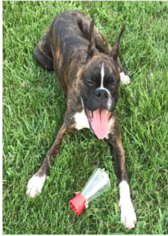
That is a BIG hummingbird!