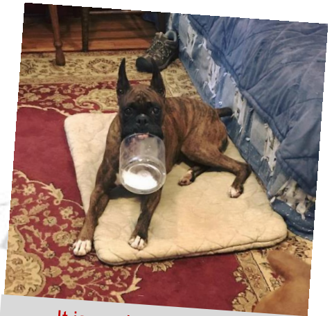
It is my jar.... With no cookies...do you see the problem?