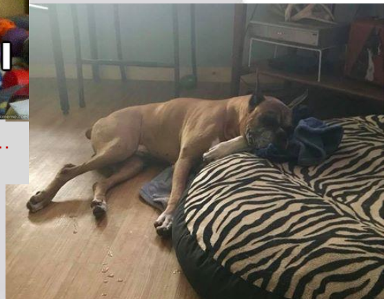
Too....tired....to make.. It ..all... the ...way....