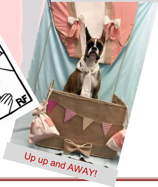
Up up and AWAY!