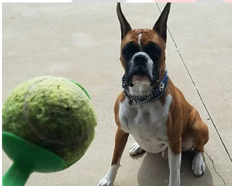
OMG...throw the ball.. Throw the ball....