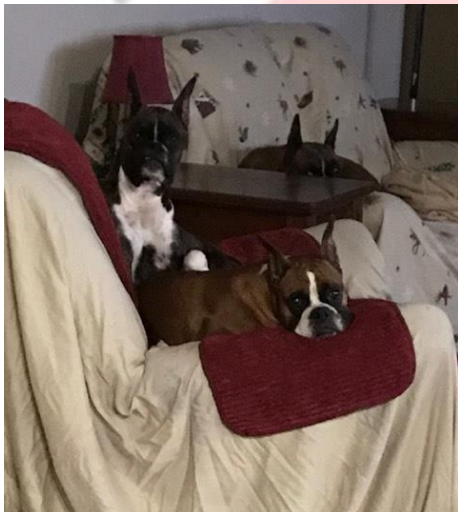
Looks like the JeSaJay clan is all settled in