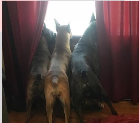
Boxer Butts...drive you nuts.... lol