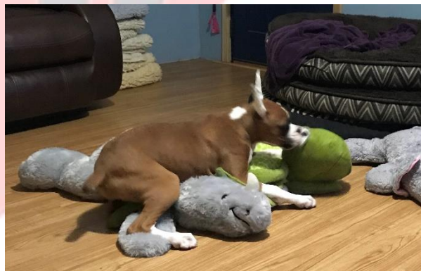
A Rhinoceros, a sea turtle and a Boxer puppy...gotta be a joke in there somewhere....

Want to see YOUR dog in the newsletter??? I do! Please send your pictures to farmoreboxers@yahoo.com