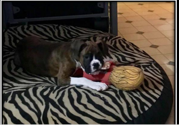
FarMore Puppy- And Hillary doll....