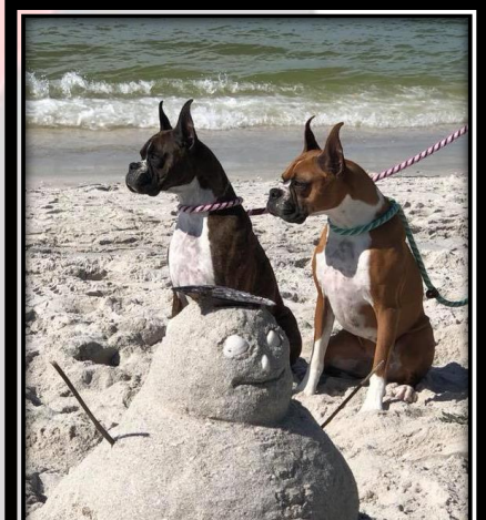
Shiloh and Caramel- enjoying the beach (JEALOUS)