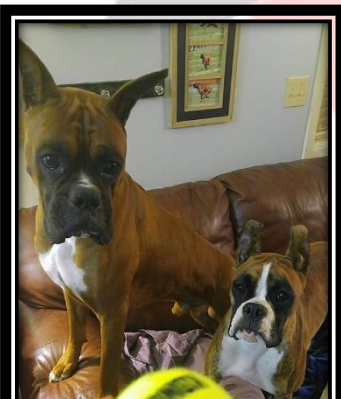
Seriously...THROW the ball...